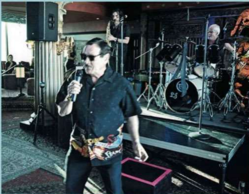
Mandalay Bay "Foundation Room"