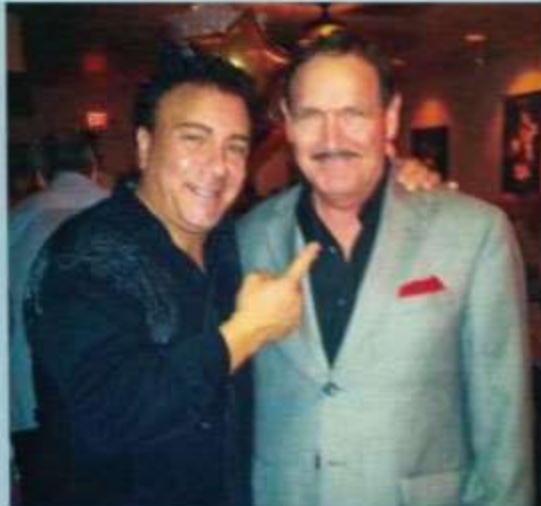
A Few Celebrity Pictures