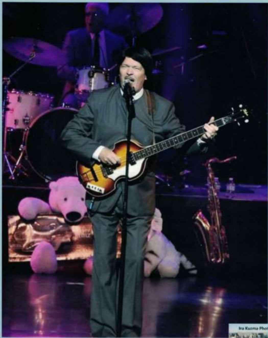
Beatles Tribute LVH "Main Room"